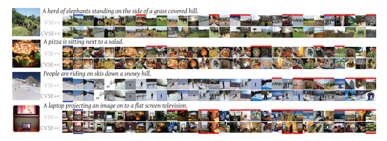
Figure 2: Comparison of the sentence-to-image top-30 retrieval results between VSE++ (baseline, 1st row) and CVSE++ (Ours, 2nd row). For each query sentence, the ground-truth image is shown on the left, the totally-relevant and totally-irrelevant retrieval results are marked by blue and red overlines/underlines, respectively. Despite that both methods retrieve the totally-relevant images at identical ranking positions, the baseline VSE++ method includes more totally-irrelevant images in the top-30 results; while our proposed CVSE++ method mitigates such problem.

where \alpha_1, \ldots, \alpha_L are the margins between different non-overlapping sentence subsets.