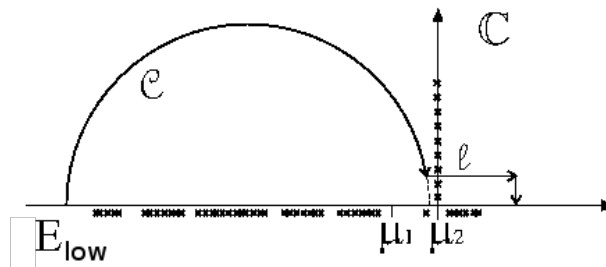
Figure 4.2: Contour integration in the complex plane for the Green's functions. The crosses represent poles of either G^r or the Fermi function.

Much of the computational work for transport is in the integration of the energy resolved density matrix, as represented via the NEGF matrix. The integration is efficiently performed with a complex contour integration and a real axis integration, as shown in Figure 4.2 and discussed in references [2, 42, 43]. All integrations are performed with Gaussian quadratures and the number