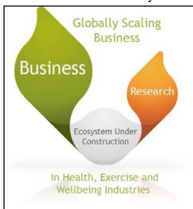
The HEW Project