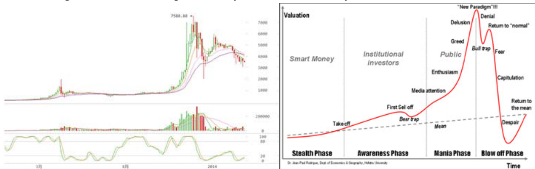
Speculative Bubbles in China's Bitcoin Market