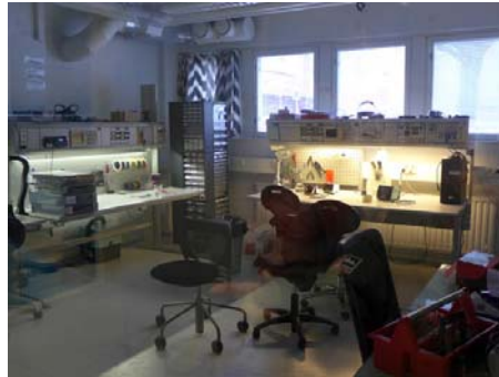
Aalto Design Factory

In my trip to Finnish universities I recognized the Finnish higher education system has very unique characteristics. Innovation is becoming the foundation of the Finnish university education. The Aalto Design Factory is an excellent example. The purpose of this Design Factory is to be a constantly developing environment for learning, teaching, research and industry co-operation related to product development and design. In Finland there is also very good university-industry relationship. Considerable research questions are from industry. Researchers and graduate students are encouraged to get funded by companies and solve real industry problems.