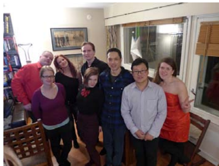
I Love Finnish Party

Definitely this winter in Finland was the best winter in my life. I liked to walk on the snow-covered Jyväskylä Lake, to visit Aalto Museum, to jog along the lakeside road, to enjoy the beautiful Jyväskylä night lights, to stroll the university town streets, and, of course, to skate on the Jyväskylä Lake ice. Most of all, I loved the Finnish parties. I will always remember the delicious food and the friendly enthusiastic people in those parties.